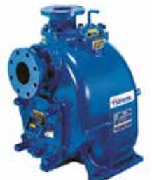
Super T Series

Suitable Industries/Uses: Municipal Wastewater Treatment, Industrial Wastewater Treatment, Lake Destratification, Mine Water Treatment