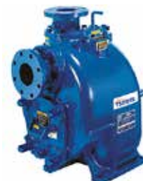
Super T Series

Suitable Industries/Uses: Municipal Wastewater Treatment, Industrial Wastewater Treatment, Lake Destratification, Mine Water Treatment