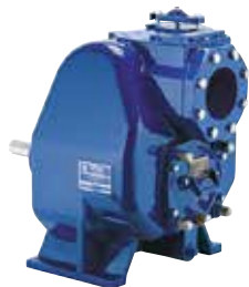
Ultra V Series