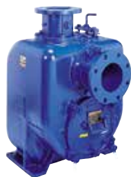
Super U Series