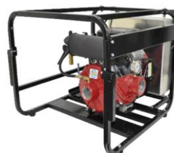
Portable high pressure pump