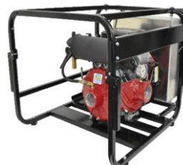
Portable high pressure pump