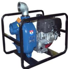
Portable trash pump